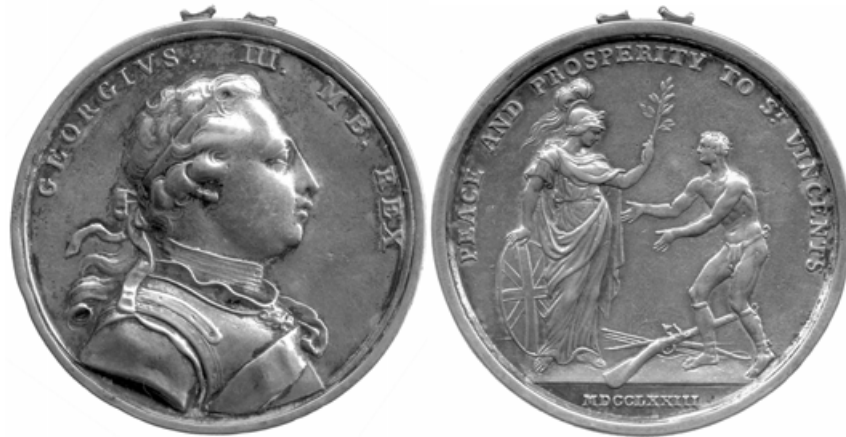
1 Carib War Medal, 1773 , in silver, by George Michael Moser, 55 mm., cast and chased, suspension broken, otherwise very fine £400-600